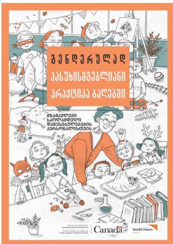
Guidebook for preschool practitioners