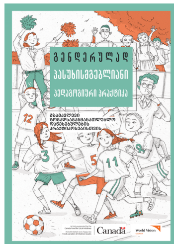
Guidebook for school personnel