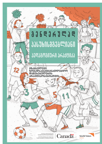
Guidebook for school personnel