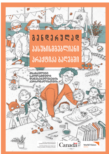
Guidebook for preschool practitioners